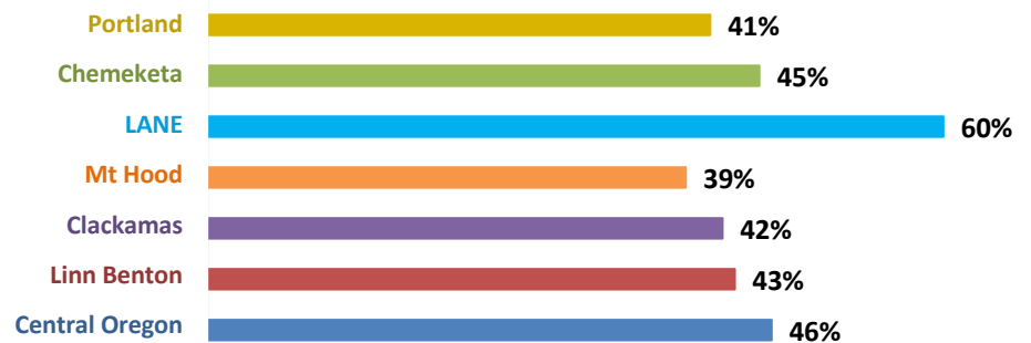
Percent Enrollment Loss at seven Oregon CCs 2012-13 to 2021-22

In the decade 2012-13 to 2021-22, enrollment losses occurred across Oregon's seven largest community colleges but were particularly severe at Lane.